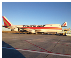
Kalitta Air Boeing 747-200