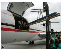
Cargojet Boeing 727-200

For speaker presentations, conference photos, media coverage or information about the conference please visit roadsrailsrunways.com .