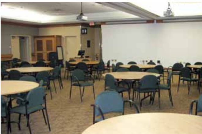
Multipurpose Room - South

Please note: Boardrooms are made available to partners in our Community Investment Program.